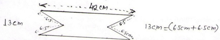
Gusset - Dimension